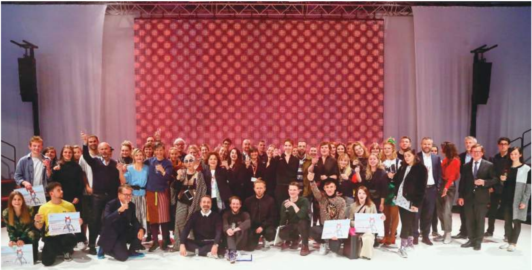
Diploma Selection 2018