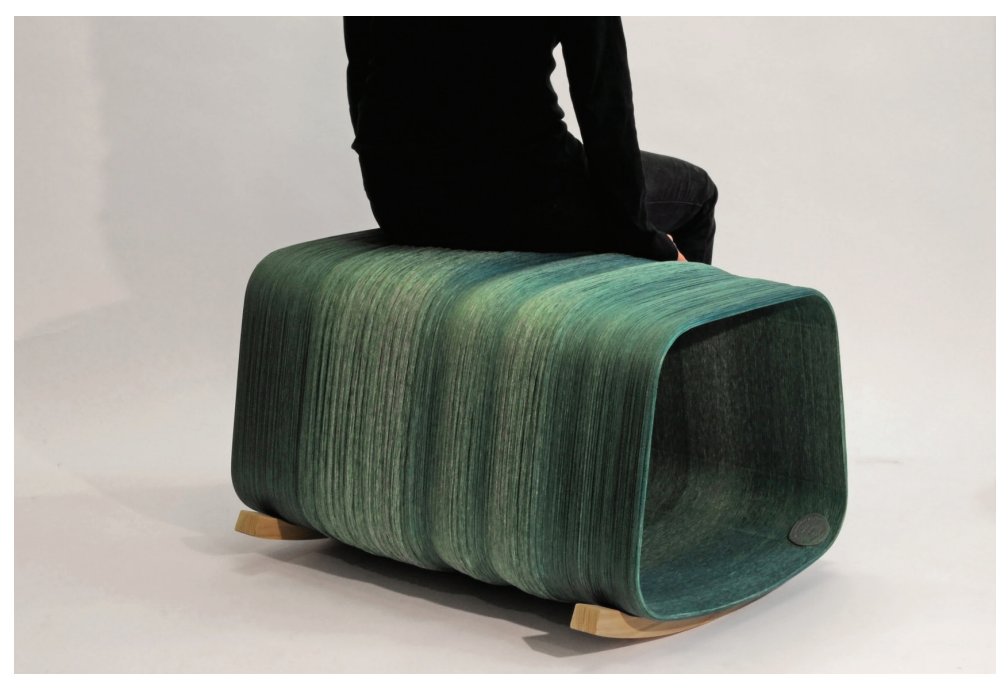
Rocking bench, produced in summer 2016